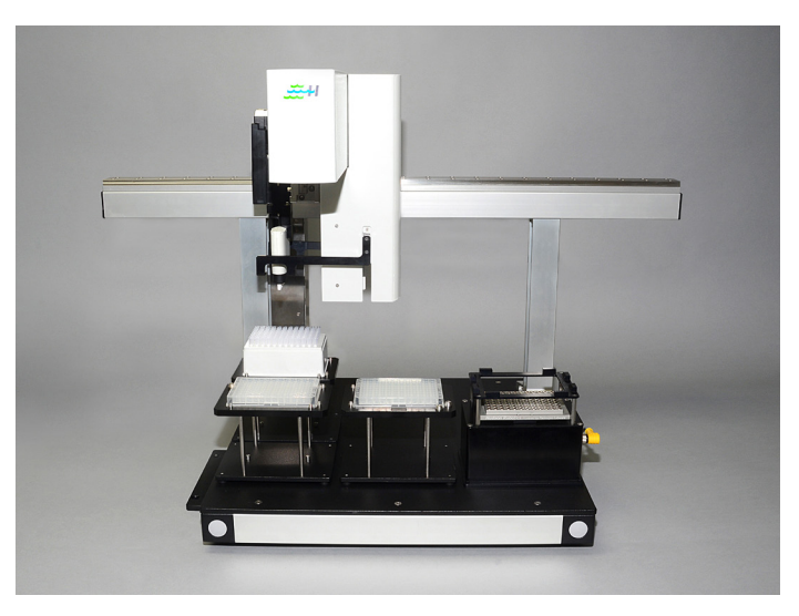
SOLO Robotic Pipettor

The SOLO™ easily fits on the lab bench and in standard fume hoods, anaerobic chambers and biosafety cabinets. It can automate large and small volume experiments, and is adaptable to SBS footprint microplates as well as flasks, tubes, and bottles. The SOLO will save valuable time and reduce errors inherent in complex, repetitive pipetting. Optional deck accessories, stackers and bulk reagent dispensing give the SOLO all the features users demand in an automated pipettor. The Soft-Linx Player software with Guided Operations (GO) technology provides technicians with pictures and a task list to easily run protocols they may never have seen before.