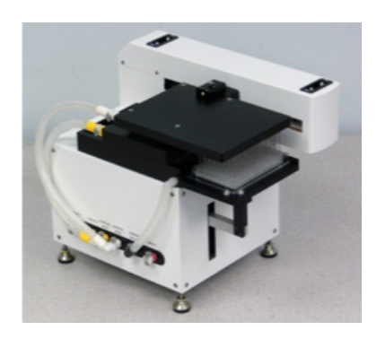
...and Standard Plates