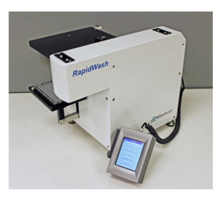
RapidWash Plate Washer