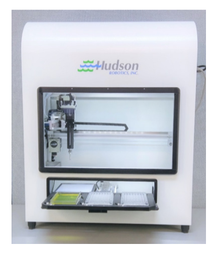
Single-Pin RapidPick™ SP