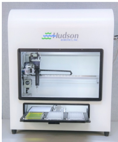
Single-Pin RapidPick™ SP