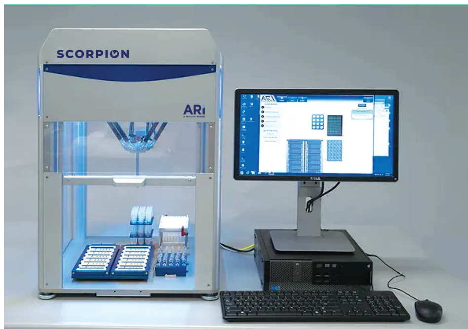
Figure 1. Scorpion (ARI) Instrument Setup

After conducting a trial of the instrument before finalizing the purchase, the installation process was straightforward and required no specialized tools. The Windows PC comes preloaded with the Scorpion Software, seamlessly connecting with the Scorpion Instrument. The software includes a comprehensive list of pre-loaded plates and racks from various consumable vendors. Art Robbins Instruments also offers the flexibility to add additional definitions upon consumer request, allowing them to send over precise product details. Utilizing precision tools, they accurately